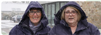
Hospice at Home