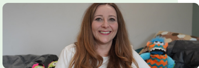
Family & Bereavement Services