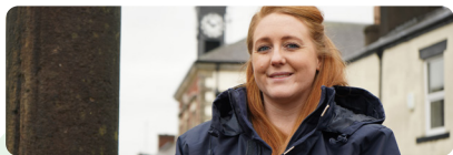
Clinical Nurse Specialists